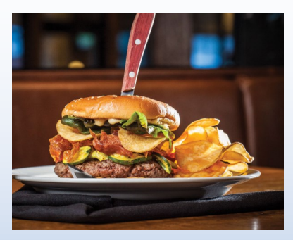
The Fix Burger Bar