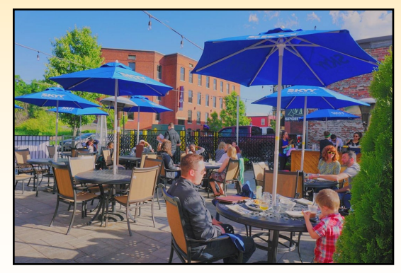
Lock 50 Restaurant & Wine Bar

multi-vendor, food-oriented marketplace in the European tradition, featuring street-oriented business of various stripes, a small-merchant market floor, the foodie-heaven Market Pantry, and a vibrant food court