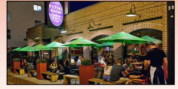
The Flying Rhino

Compact, landmark eatery serving thin-crust pies, burgers & draft brews