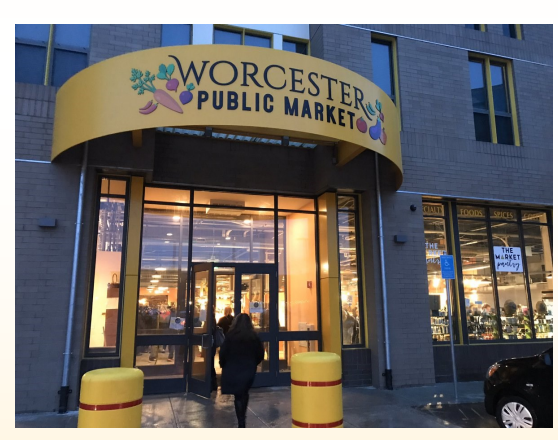
Worcester Public Market