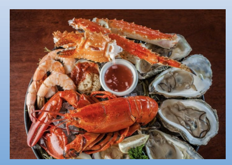
The Sole Proprietor