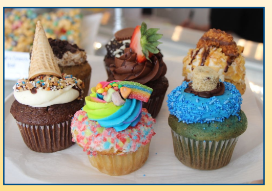
The Queen's Cups